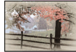
Landscape in Pink

now is in the process of publishing a literary book including poetry and short stories.